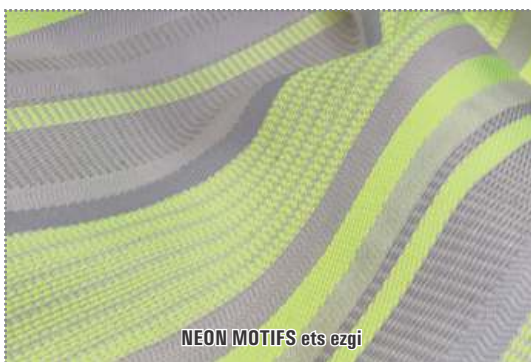
NEON MOTIFS ets ezgi