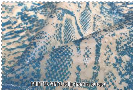
PRINTED VINYL teijin frontier europe