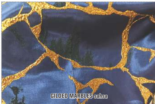
GUIDED MARBLES sahsa