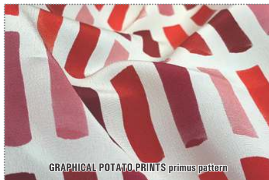
GRAPHICAL POTATO PRINTS primus pattern