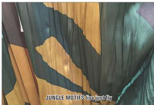
JUNGLE MOTIFS lisa just fly