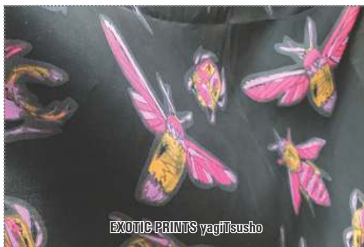
EXOTIC PRINTS yagjiTsusho