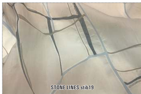
STONE LINES stib19