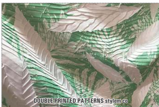
DOUBLE PRINTED PATTERNS stylem co