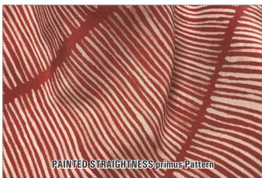
PAINTED STRAIGHTNESS primus Pattern