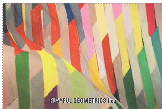
PLAYFUL GEOMETRICS lica