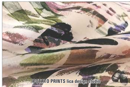
POTATO PRINTS lica design studio