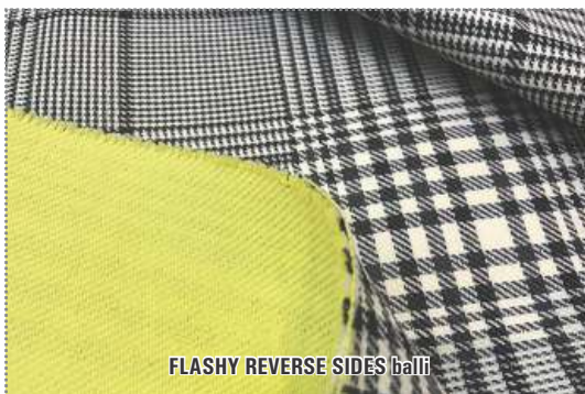
FLASHY REVERSE SIDES balli