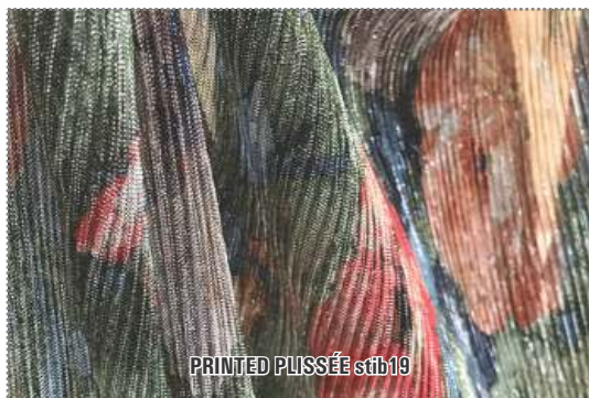
PRINTED PLISSÉE stib19