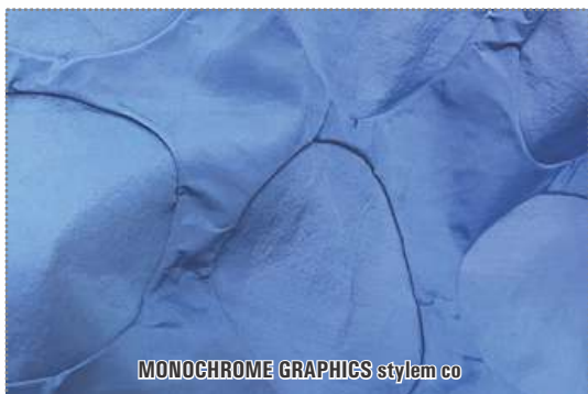
MONOCHROME GRAPHICS stylem co