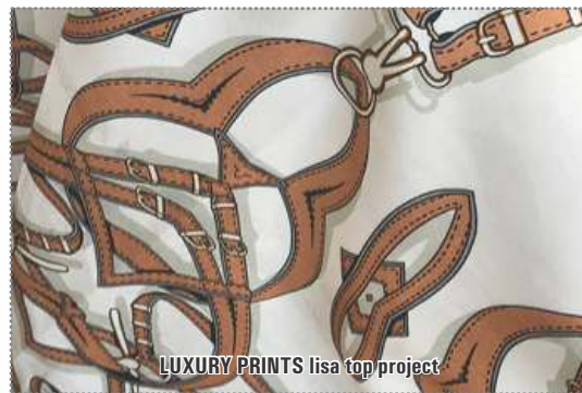
LUXURY PRINTS lisa top project