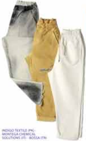
INDIGO TEXTILE (FR) - MONTICA CHEMICAL SOLUTIONS LTD - BOSSA (FR)

An '80s inspiration, for short jackets with volume. Tracksuits and casual cuts for separates, that invite new layered looks, and fluid silhouettes for a casual urban inspiration.