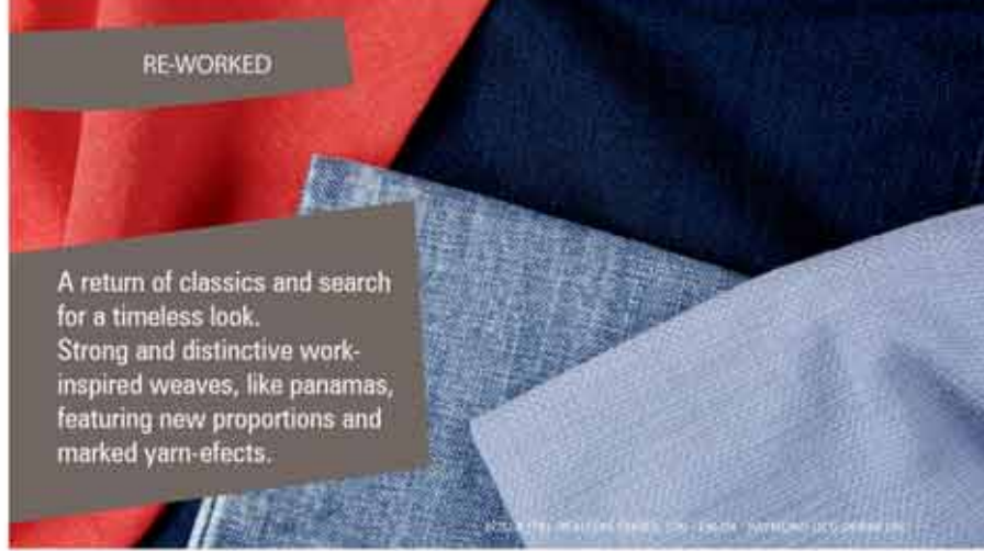
AKKUS TEXTILE (FR) - MASTER TEXTILE (FR) - SQUARE DENIM LTD (IND) - SHARABAT DENIM (FR)

A return of classics and search for a timeless look. Strong and distinctive work-inspired weaves, like panamas, featuring new proportions and marked yarn-effects.