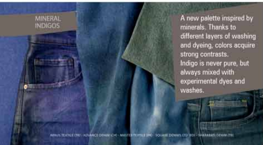
AKKUS TEXTILE (FR) - ADVANCE DENIM (CH) - MASTER TEXTILE (FR) - SQUARE DENIM LTD (IND) - SHARABAT DENIM (FR)

A new palette inspired by minerals. Thanks to different layers of washing and dyeing, colors acquire strong contrasts. Indigo is never pure, but always mixed with experimental dyes and washes.