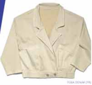
FOGA DENIM (FR)