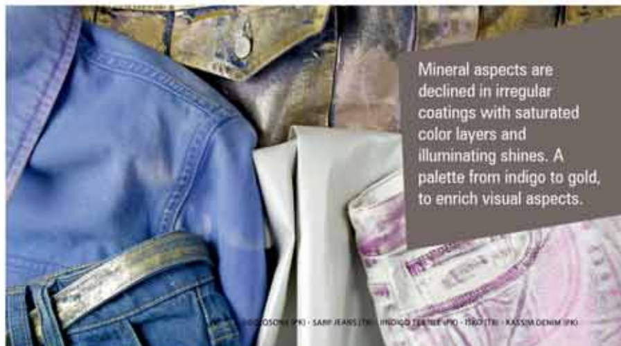
AKKUS TEXTILE (FR) - SHARABAT DENIM (FR) - INDIGO TEXTILE (FR) - TROTT (FR) - KASSIA DENIM (FR)

Mineral aspects are declined in irregular coatings with saturated color layers and illuminating shines. A palette from indigo to gold, to enrich visual aspects.