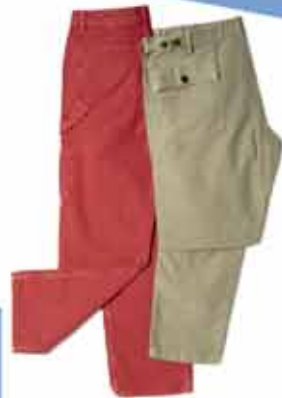
VELCOREX (FR) - RED BUTTON (FR) - BOSSA (FR)