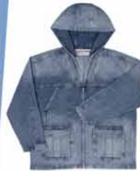
AKKUS TEXTILE (FR)