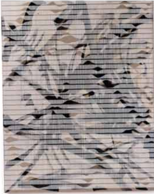
Untitled (sp), 2022 ©Frank Moll