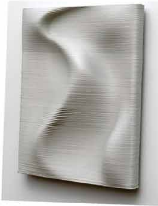
Digital Dust ©Noor Nuyten