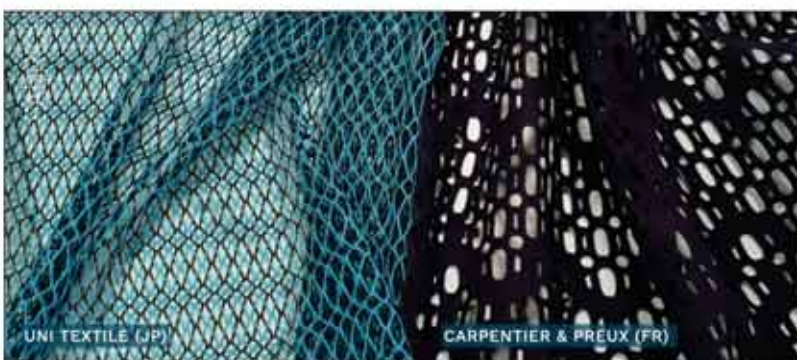
UNI TEXTILE (JP)