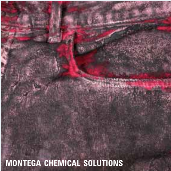
MONTEGA CHEMICAL SOLUTIONS