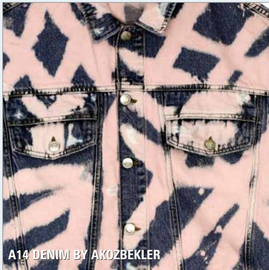
A14 DENIM BY AKOZBEKLER