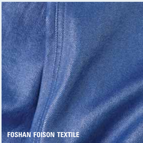
FOSHAN FOISON TEXTILE