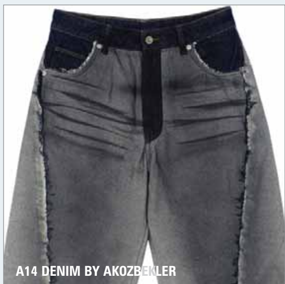
A14 DENIM BY AKOZBEKLER